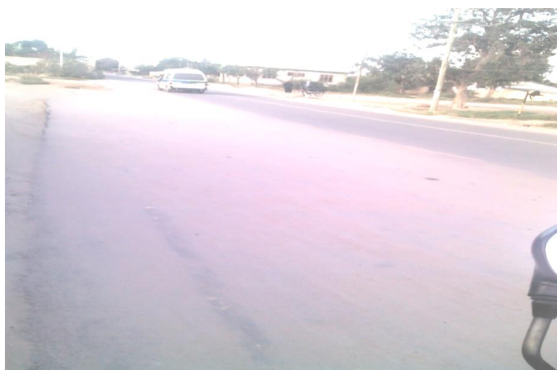
Plate 1: A new road constructed at Chang'ombe ward

The findings showed there were development initiatives undertaken by the government, non-governmental organizations, governmental organizations and community members for community development in line National Strategy for Growth and Reduction of Poverty (NSGRP) (URT, 2005 and 2008). Those projects helped to improve provision of different services in the ward as acknowledged by respondents basing on the outcomes of the implemented projects and programme.